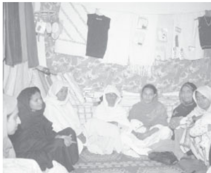
Female shopkeepers and health care workers in the Haripur District of Pakistan attend a training session on safe birthing kits.

Key caregivers at each level of the continuum must have the capacity to deliver basic care, and the ability to appropriately manage or refer women and newborns for additional or emergency services. Through close collaboration with