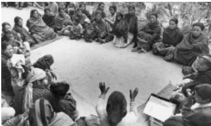
Community members attend a newborn health meeting in Nepal.