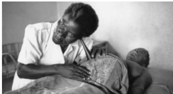
Pregnant woman receiving antinatal care in Malawi.

It is essential that the proposed quality, evidence-based EMNC interventions are performed consistently at each level of the continuum to ensure continuity of care for the woman and her newborn—from the mothers and families at the household level to peripheral facilities and the district hospital. The investment of resources from multiple stakeholders, including the MOH and other government ministries, donor agencies, faith-based organizations (FBOs), and local and international NGOs will be required to achieve this goal. For this reason, multidisciplinary teams involving representatives from all three levels of care should be fully engaged in program planning, implementation, monitoring and evaluation.