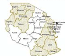
ACCESS-TANZANIA Program ANC Training Coverage Between Oct 2005 and May 2008