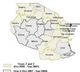
ACCESS-TANZANIA Program FANC Training Coverage By Sep 2008